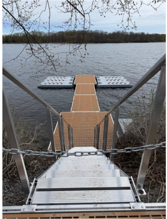
Their first customer